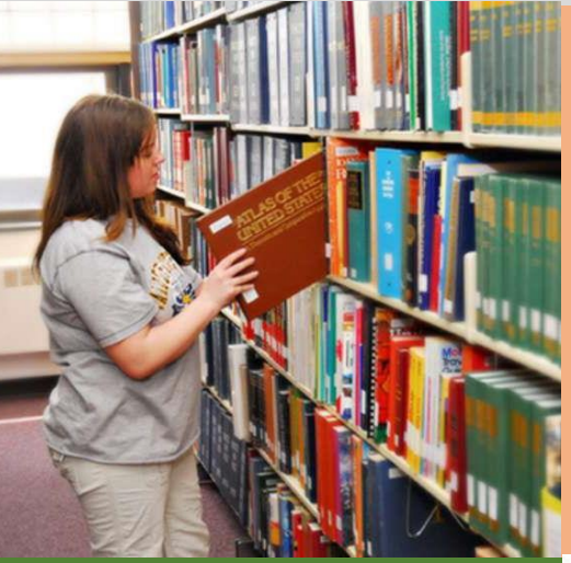
86.84% of respondents reported that our faculty provided above-average instruction.